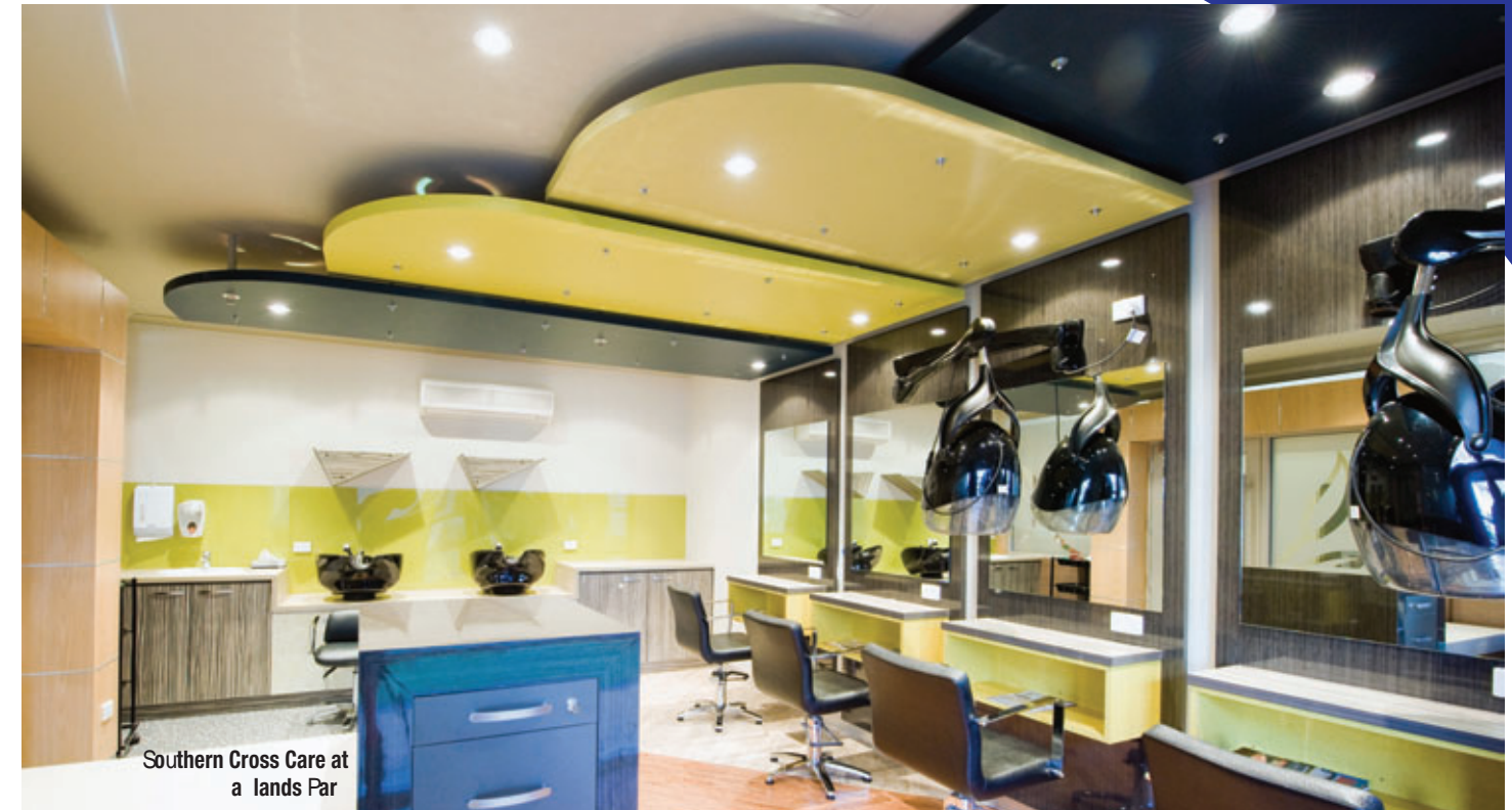
Southern Cross Care at a lands Par

The company's standards have been recognised by the overnment providing grants to assist in expansion. High - end professionalism is evident in the technology adopted by Comace, such as special software for time management and systems control.