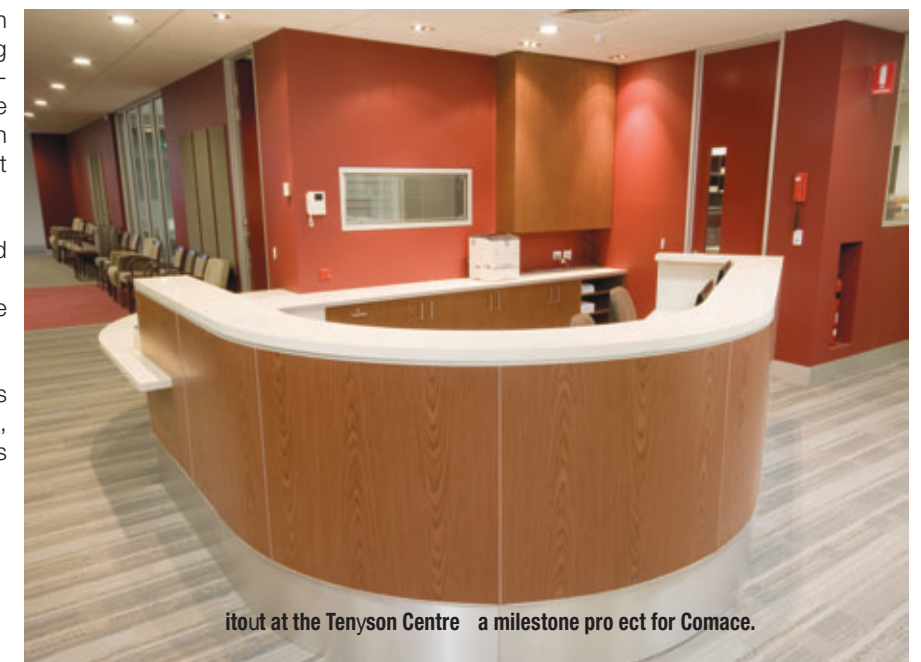
itout at the Tenyson Centre a milestone pro ect for Comace.

Training for Comace leaders is mandatory in the professional skills of OH&S, senior first aid, emergency evacuation and fire fighting.