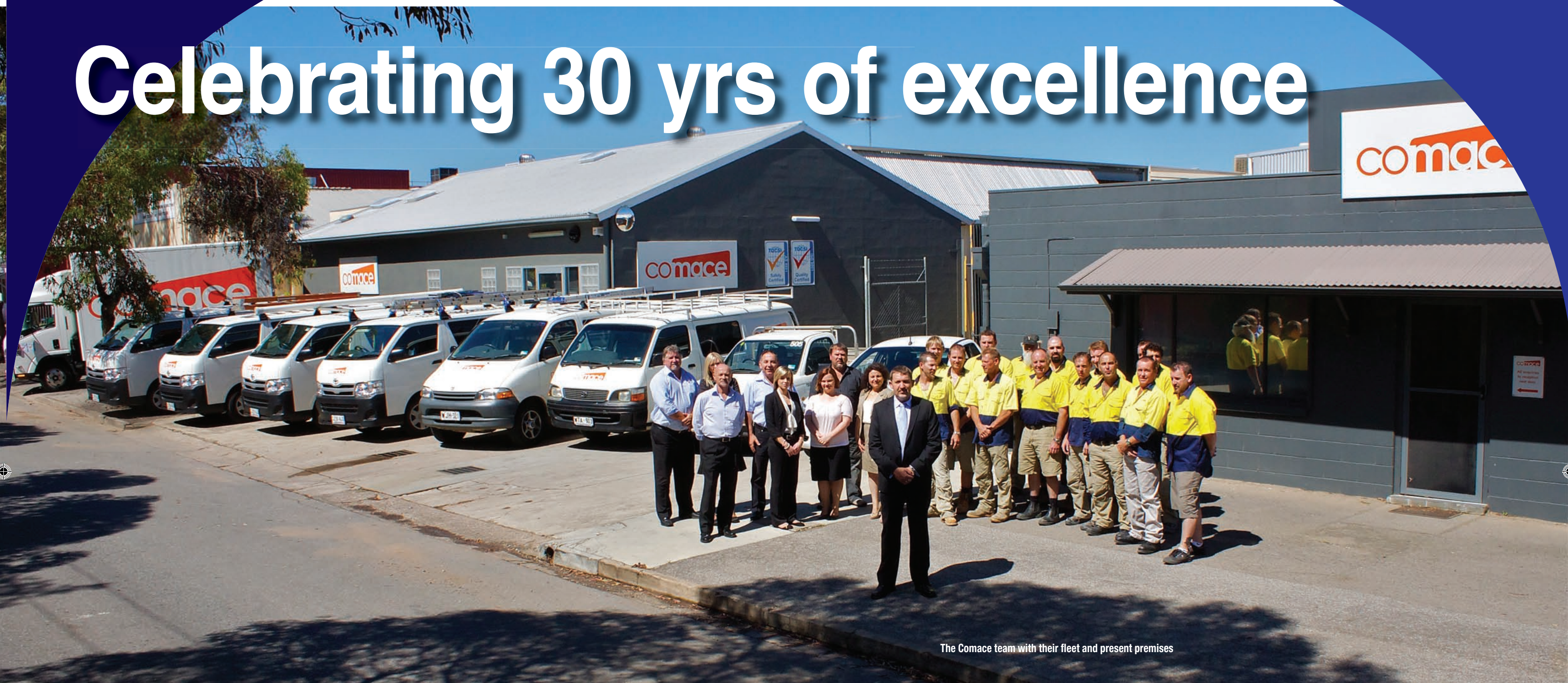
The Comace team with their fleet and present premises