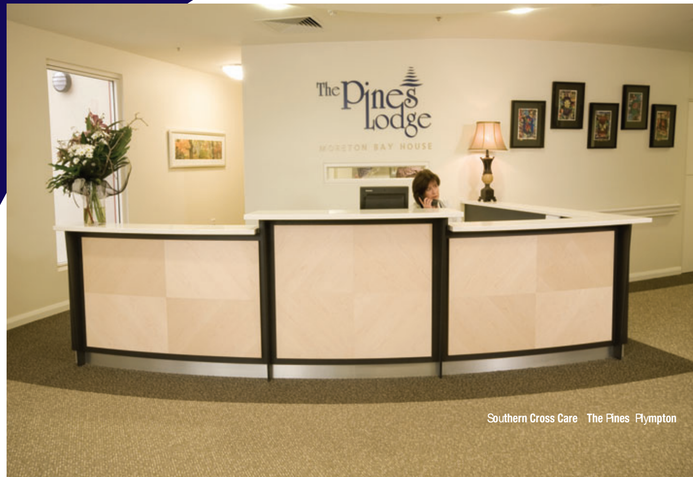
Southern Cross Care The Pines Plympton